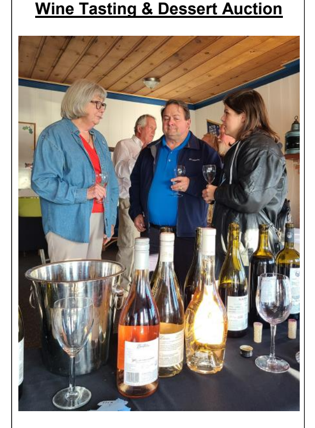
Members and guests gathered at EYC to taste good wine, good food, and good desserts at the annual fund raising event.