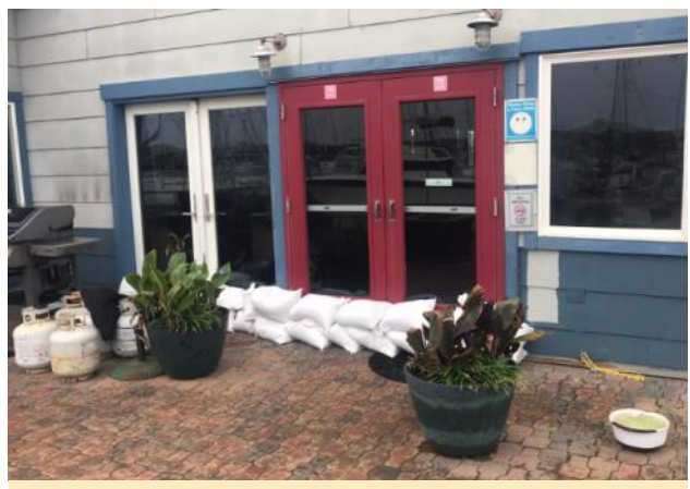
The hatches were battened down just in time for the rain to start again.