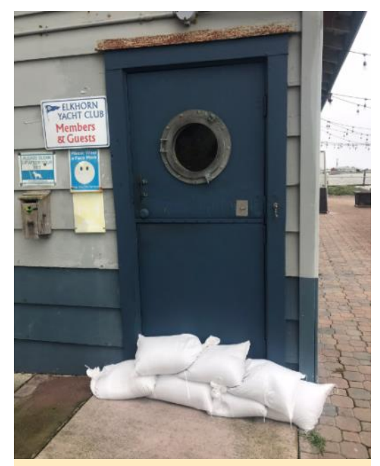
The bar must be saved!!!