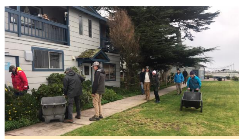
Brian Ackerman (red jacket on left) places the last sandbag to protect the annex.