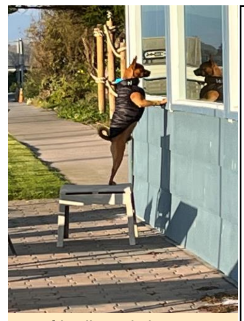
As a friendly reminder, pets are not allowed inside the club.