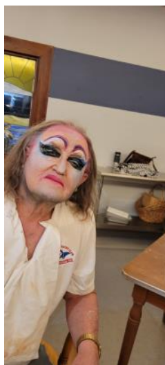
JD made up