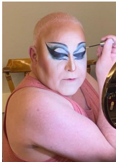
Woo Woo leading the make-up session