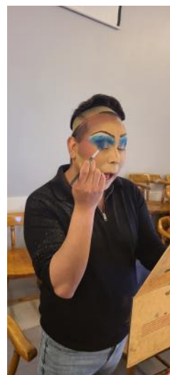
Sexxen giving tips on application