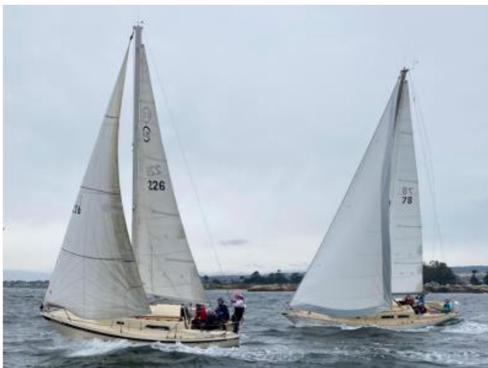
Un Bel Di (left) and Solace (right) head up to the Natural Bridges race mark.

There were six more boats this year compared to 2022, which made for a thrilling start!