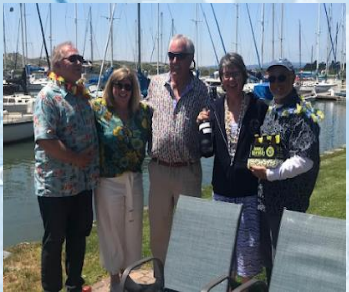
Owners and crew celebrate their survival of the maiden voyage of the Ardent while simultaneously planning how to get the band back together for the next trip!