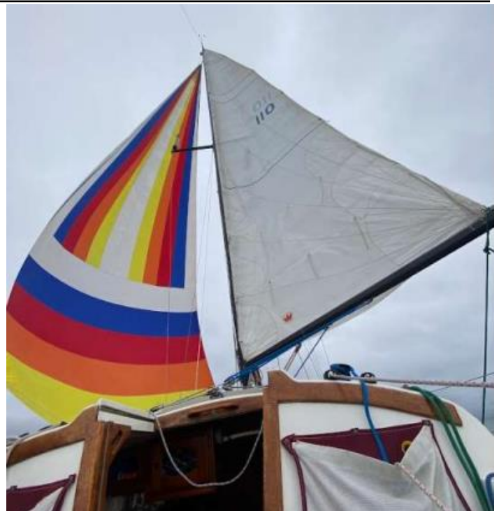
Cutlass goes wing on wing downwind to Moss Landing.