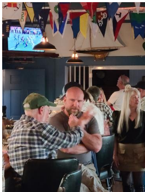
Are You Ready?