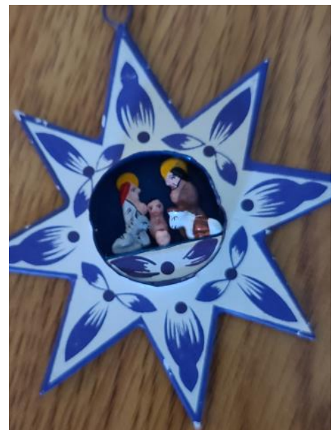
Hide and Seek

Monday Night Football is back. Join us at the EYC for a $10 dinner and lots of friendly discussions. Oh, there's a football game on, too!