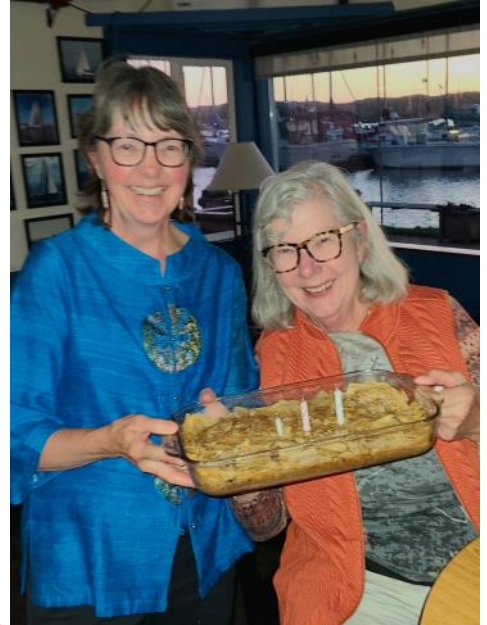
More Birthday Enchantment