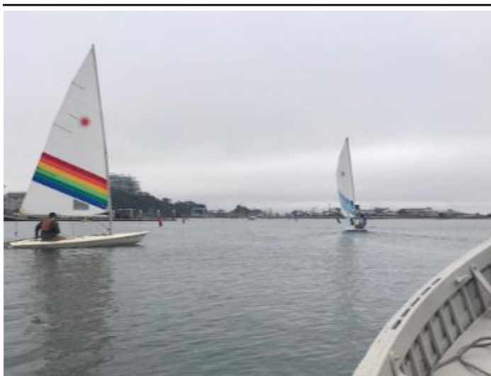
Both Lasers navigate the channel with the EYC safety boat standing by.