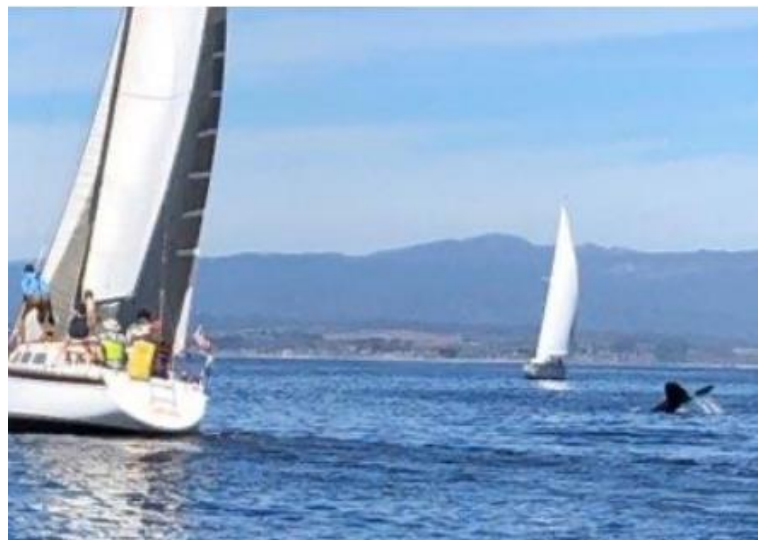
Whales made race navigation challenging!