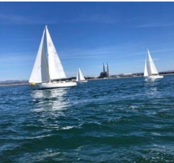
Six boats made for an exciting race start!