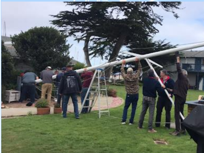
Although too blustery for safe racing, a host of volunteers raised the flagpole despite the wind!