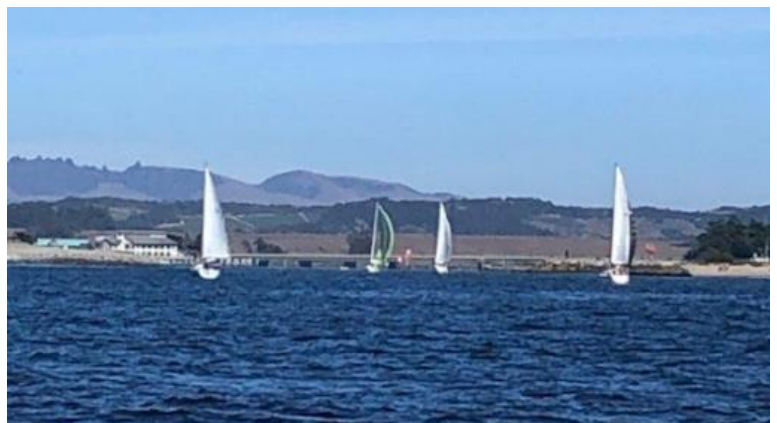
After a close finish, the fleet heads back to harbor.