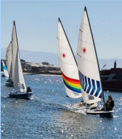
Lasers sprint to the finish!