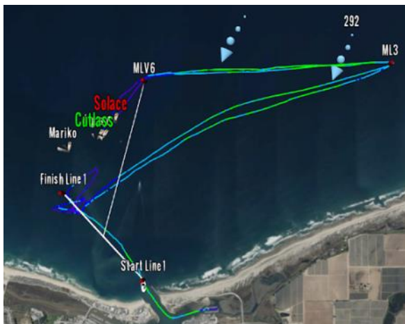
RaceQs tracked most of the racing fleet and made for an interesting replay.