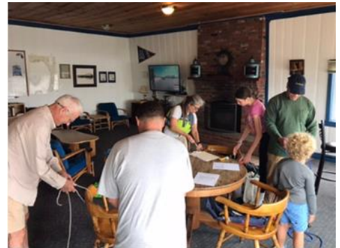
Waivers, paperwork, and practice with essential knots kicked things off.