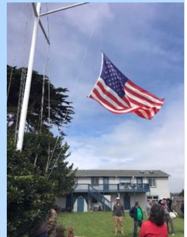
The US flag was raised, then lowered to half-mast for Senator Feinstein.