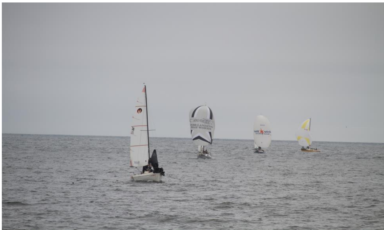
2020 Little Boreas