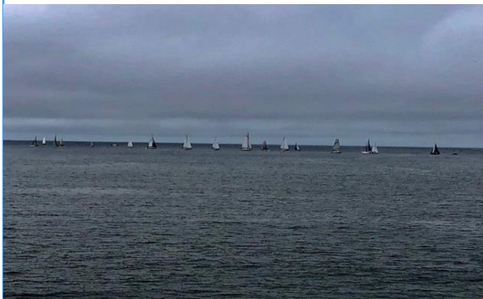
Little Boreas start from Santa Cruz Wharf