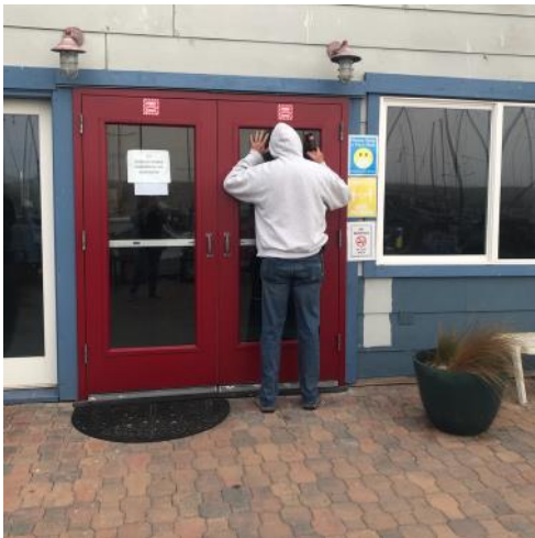
Members anxiously awaited the Election results out on the patio.