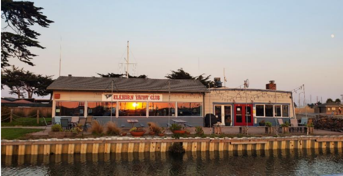
Another beautiful sunset at the Club.