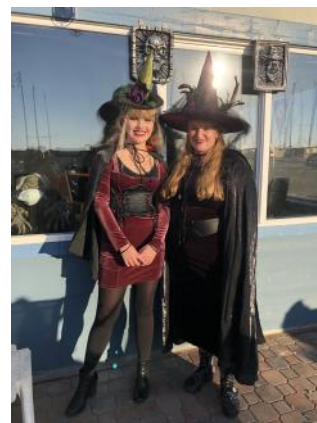
The Dowling Witches made an appearance.