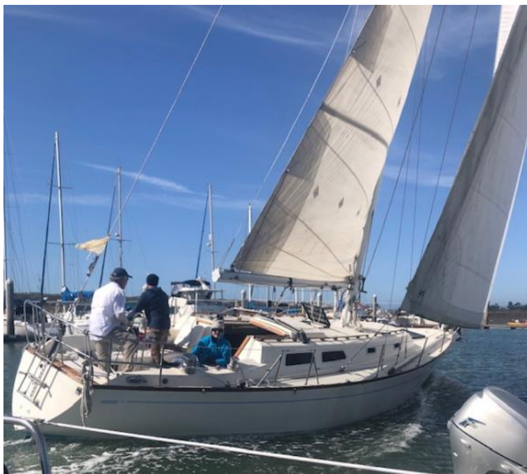
Keith's top gun sail by.