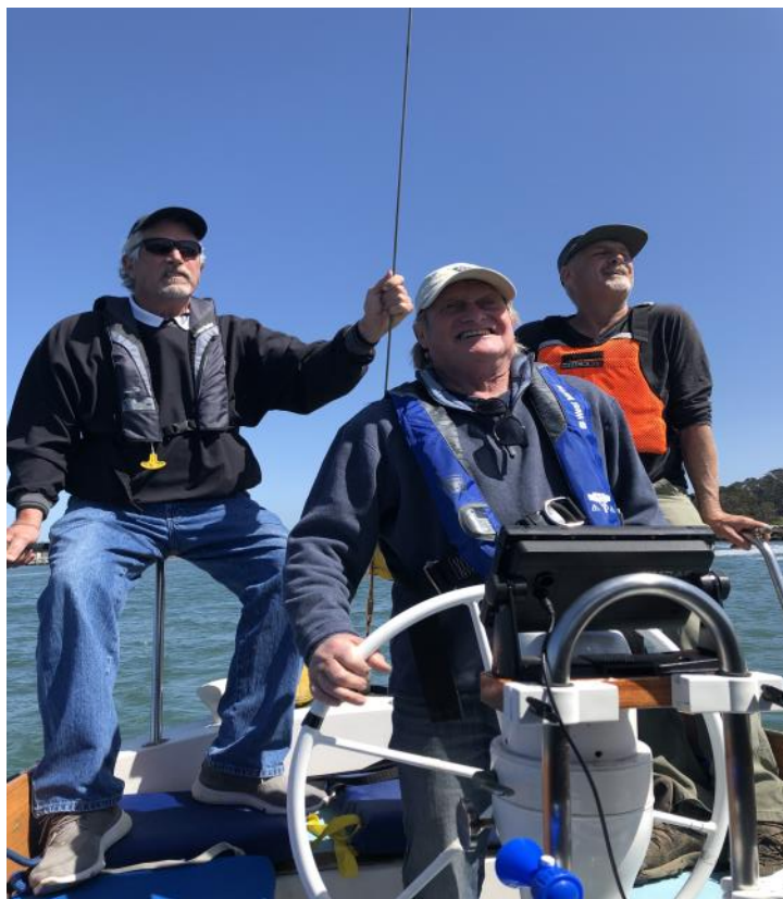
Fun Sail #1 on LegaSea.