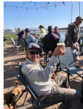
Members enjoyed the Quarterly Birthday Bash on a sunny Saturday.