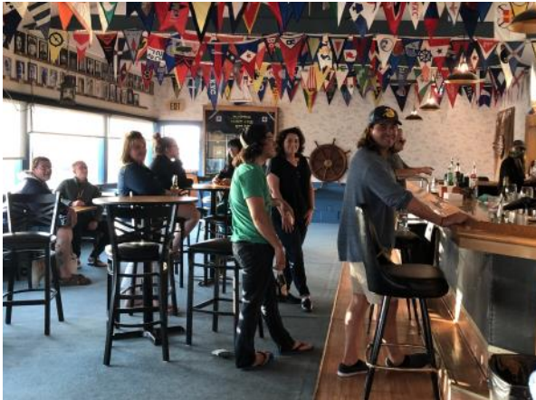
Members enjoying the first day of the bar opening back up.