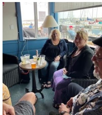
Enjoying the bars new cozy corner