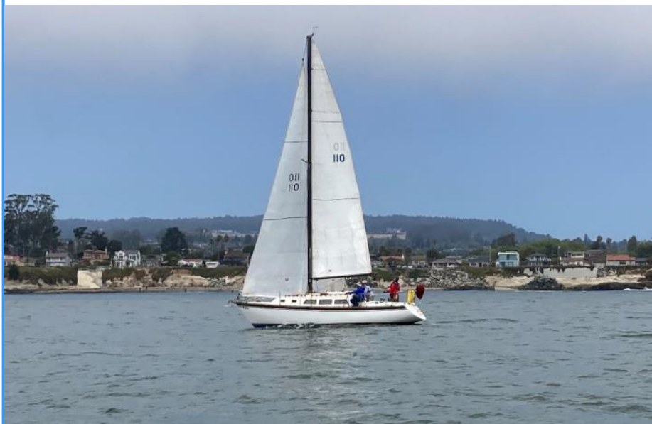
Cutlass in the Little Boreas Race