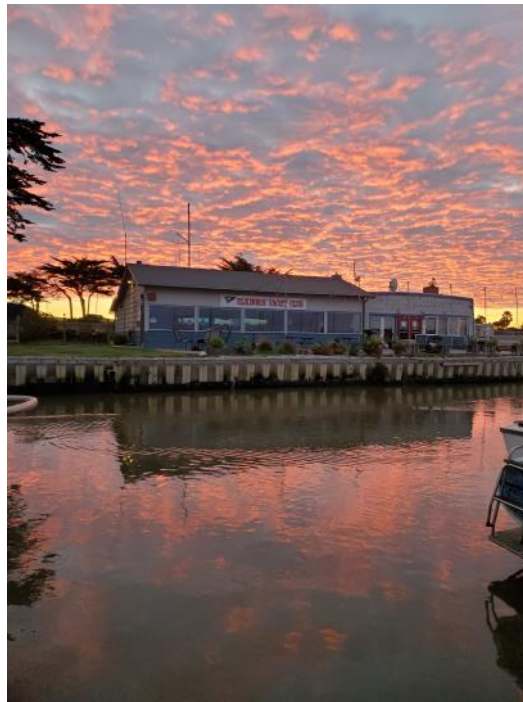
The Club in all of its sunset glory.