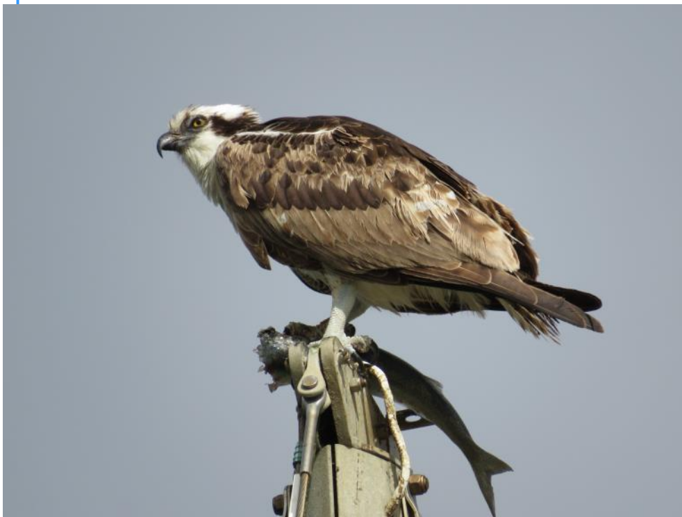
The resident Osprey enjoys outdoor dining at EYC.