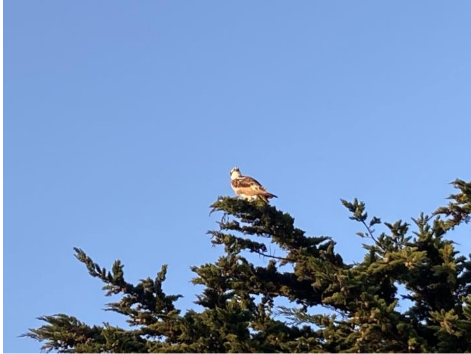
The Resident Osprey a top the Cypress Tree.