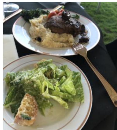
Filet mignon & caesar salad.