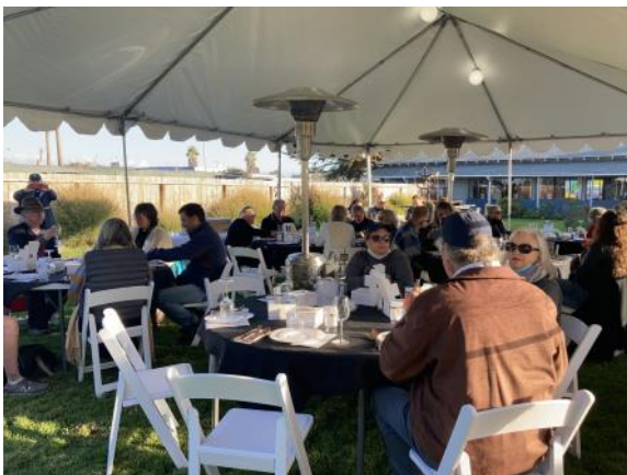
Staying warm under the canopy