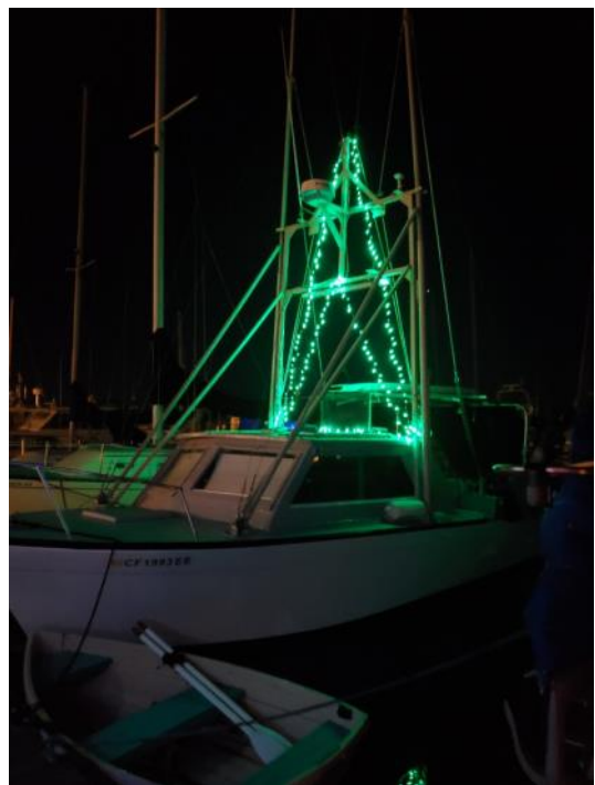
Holiday cheer on Norm's boat.