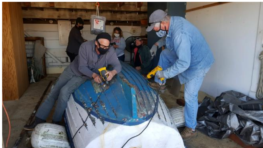
Members working on the launch.