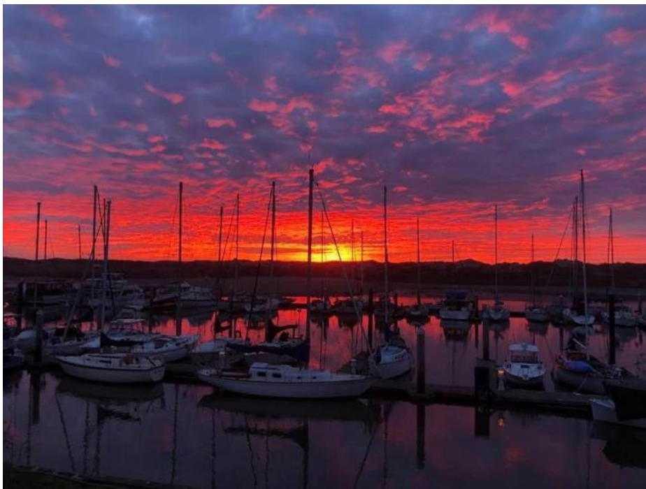
A breathtaking winter sunset at the Club.