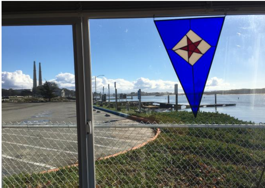
A sunny nook in the Clubhouse.